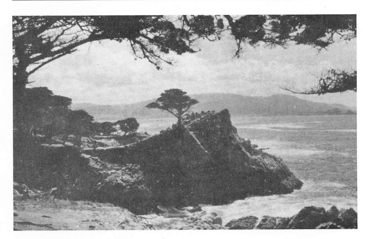
"Lone Cypress-World Famous 17 Mile Drive, Del Monte, California."

write about regional expression and the literature of place without reverting to these particular zoning restrictions. At a time when critical diversity has been vigorously championed, regional writing has been relegated to the periphery not because it is not diverse enough, but because it is not diverse in the proper ways that is, in the terms most critics now feel comfortable invoking.