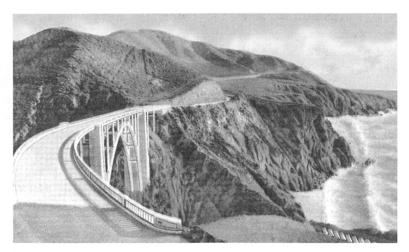
Mill Creek Bridge, Carmel-San Simeon Highway, 18 miles south of Monterey, California.

Please Note: The speaker for the follow-up to the feature article has yet to be confirmed (see page 2). You will receive a special invitation once the date and time have been arranged.