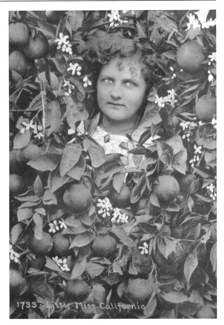
"Little Miss California," circa 1911.

Yet you would never know this from contemporary criticism, for finding region an important factor in literary studies is now usually seen as the equivalent of being an overenthusiastic salesman with a special marketing territory. Regionalism, it seems, is often next to boosterism, a fatuous puffing of merely local talent—a kind of literary chamber of commerce juxtaposed to the three national congressional houses of race, class, and gender. (Criticism in this regard seems to take its cue from the