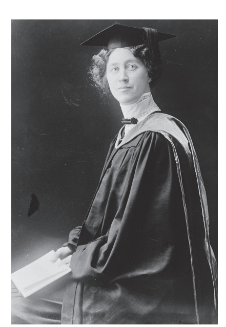
Annette Abott Adams, 1910.

secret printing press in Calcutta, India, to disseminate German propaganda against the British; the role of the German Foreign Office in Berlin in orchestrating the movement of Indian men and arms across the oceans by spending tens of thousands of dollars.