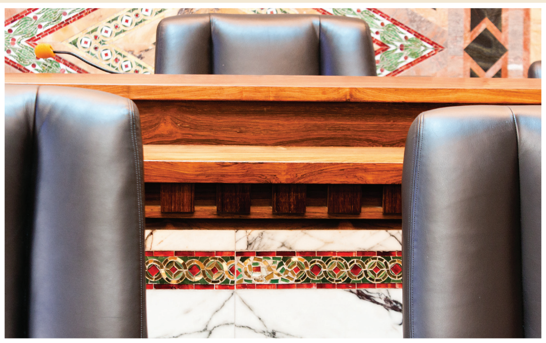
San Francisco federal courtroom in which Hindu-German conspiracy trial and shooting took place. Bottom photo shows damage to mosaic tiles visible today.