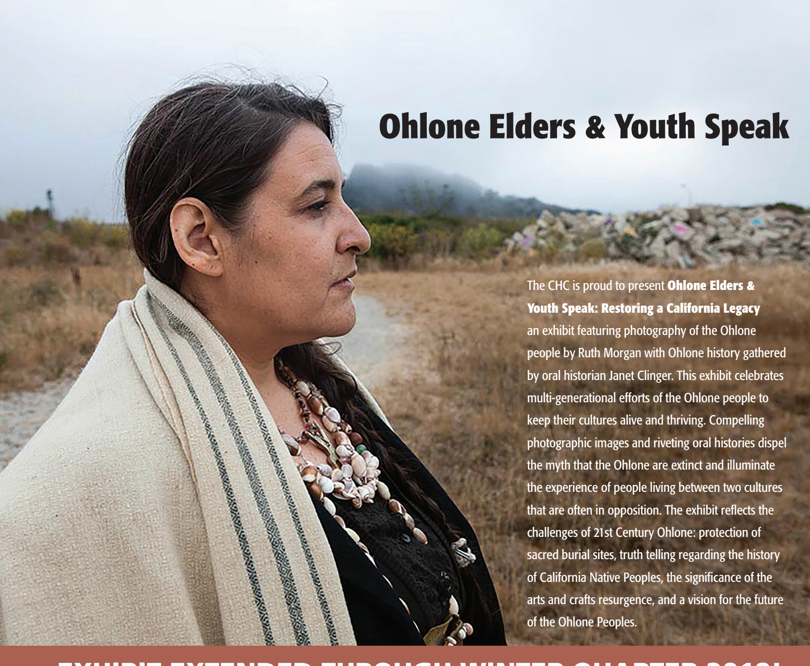
EXHIBIT EXTENDED THROUGH WINTER QUARTER 2018!